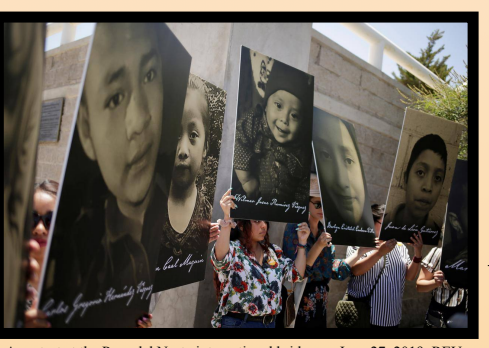
A protest at the Paso del Norte international bridge on June 27, 2019. REU researchers holding pictures of migrant children that died in U.S. custody.

We used mixed methods consisting of short interviews and critical observations on due process, language barriers, access to legal counsel, Know Your Rights workshops, the documentation of human rights violations, biases of judges and important policies such as "metering" that negatively impact the safety of migrants by returning them to dangerous locations in Mexico.